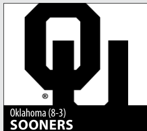
Oklahoma (8-3) SOONERS