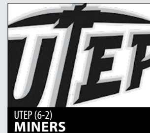
UTEP (6-2) MINERS

Date ..... Monday, Dec. 21 Tip Time ..... 5:32 p.m. CST Radio ..... KOKC AM 1520 in OKC; ..... KMOD 97.5 FM in Tulsa; Sirius 121 TV ..... ESPN2 Webcast ..... ESPN360.com Series ..... OU leads 2-0 Last Meeting ..... 70-58 (Dec. 1, 1960)